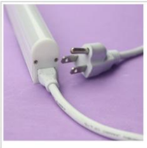
Fixture End with Plug-in Cord