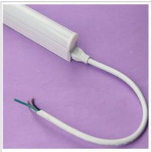
Fixture Ends with Integrated Plugs