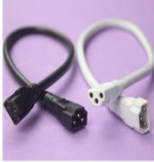
Daisy Chain Cord (1 pcs)