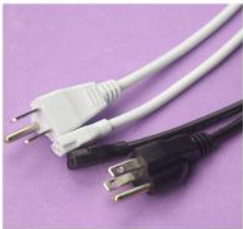
Power Cord (1 pcs)