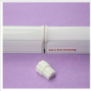
Daisy-Chaining Using Integrated Plugs