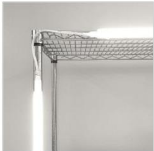
Daisy-Chaining Using Cable