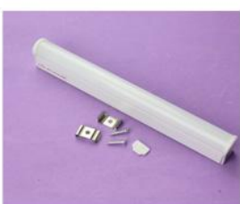
Screws & Mounting Clips (2 pcs)